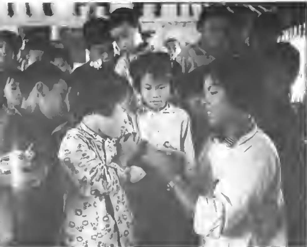
A "barefoot doctor" gives inoculations.